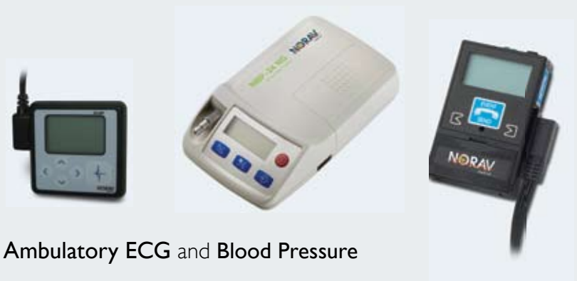
Ambulatory ECG and Blood Pressure