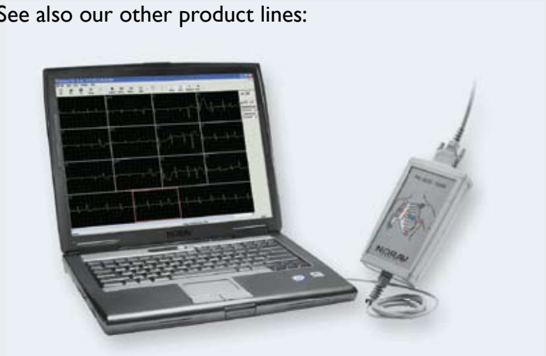
Rest 12 lead ECG